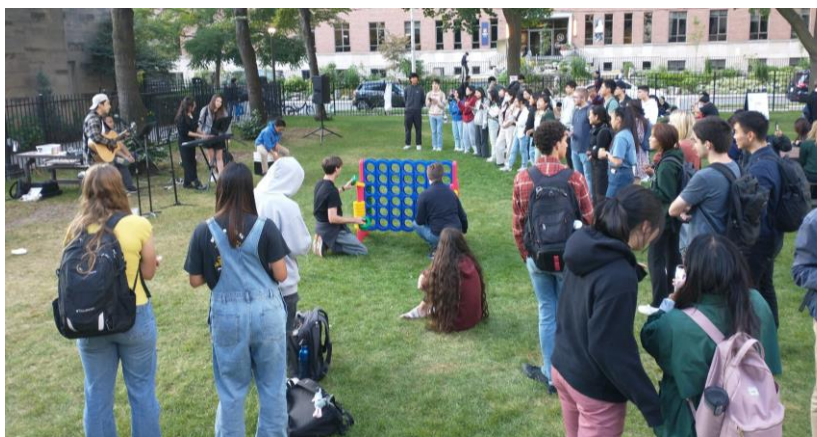
Students at St. Michael's Welcome Back BBQ, September 13, 2023

What does it look like to create community on campus in the fall of 2023? A central theme to ECUT's vision is to build a vibrant community of faith on campus, where students can connect with one another and grow in their knowledge and love of God. We see a need for students to live life together, support one another, pray for one another, serve others, and grow in faith together. Here are some snapshots of what that looks like.