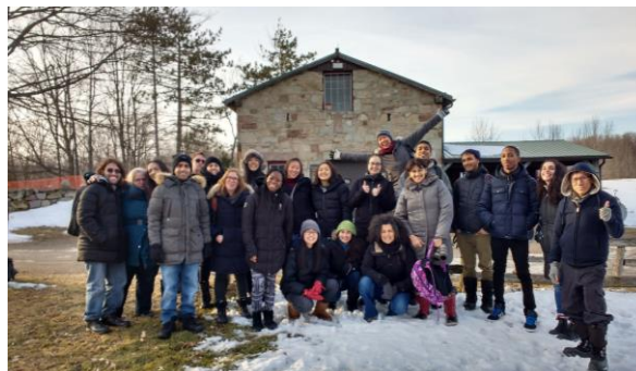
Students at an Ecology & Spirituality Retreat